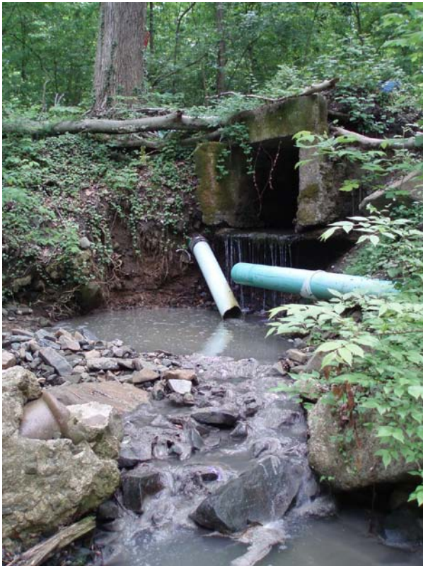
Figure 2. Direct, continuous discharge: broken sanitary line.