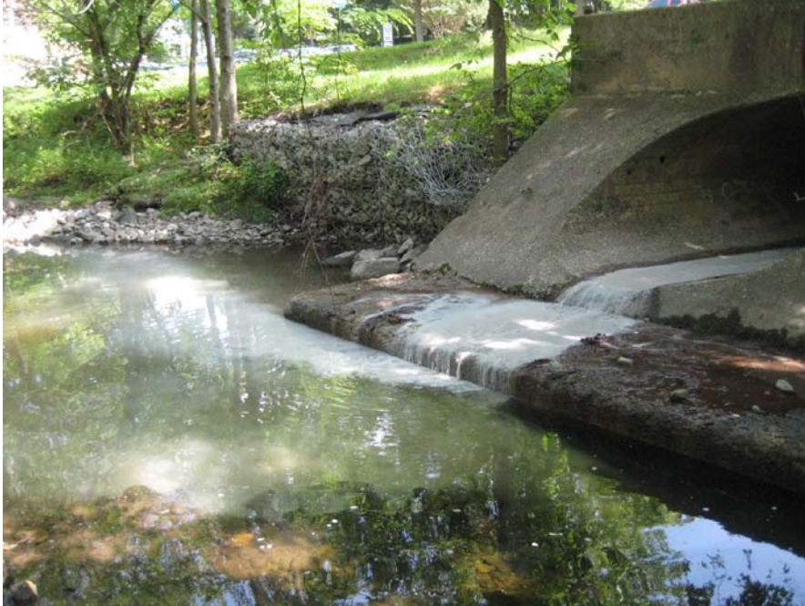
Figure 1. Indirect, transient discharge: concrete slurry discharges from storm drain outfall to stream.