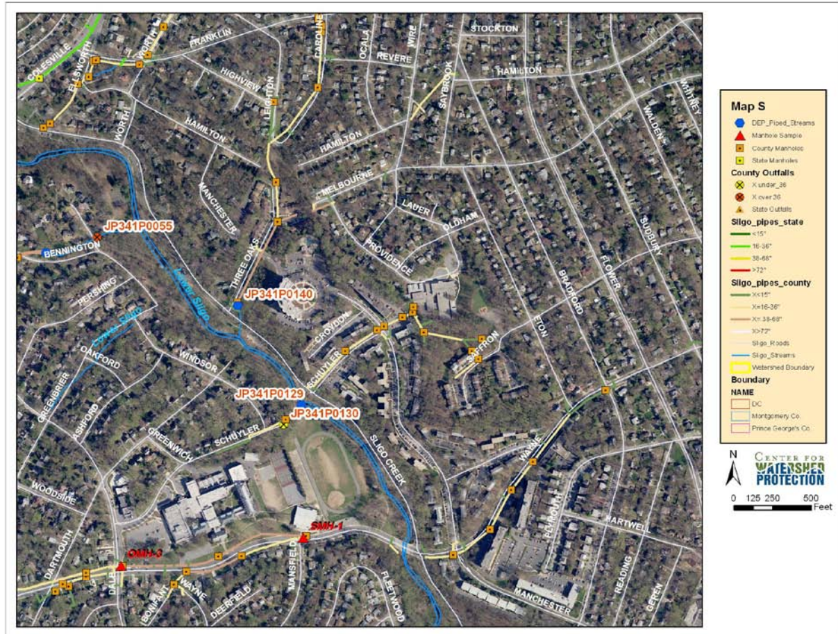
Figure 4. Example field map at 1:6,000 scale.

A field and lab supply list is provided in Table 5.