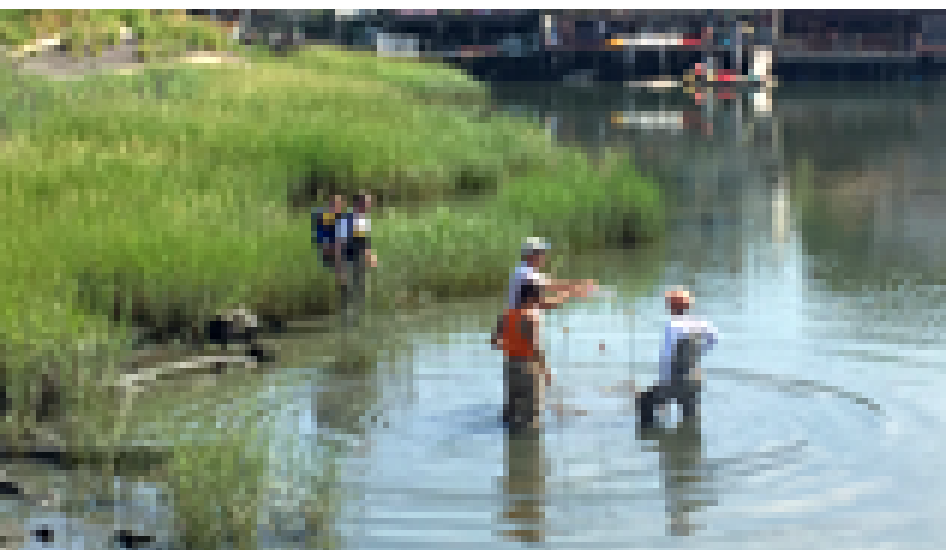
For more information and registration visit, https://wir_wqm.eventbrite.com