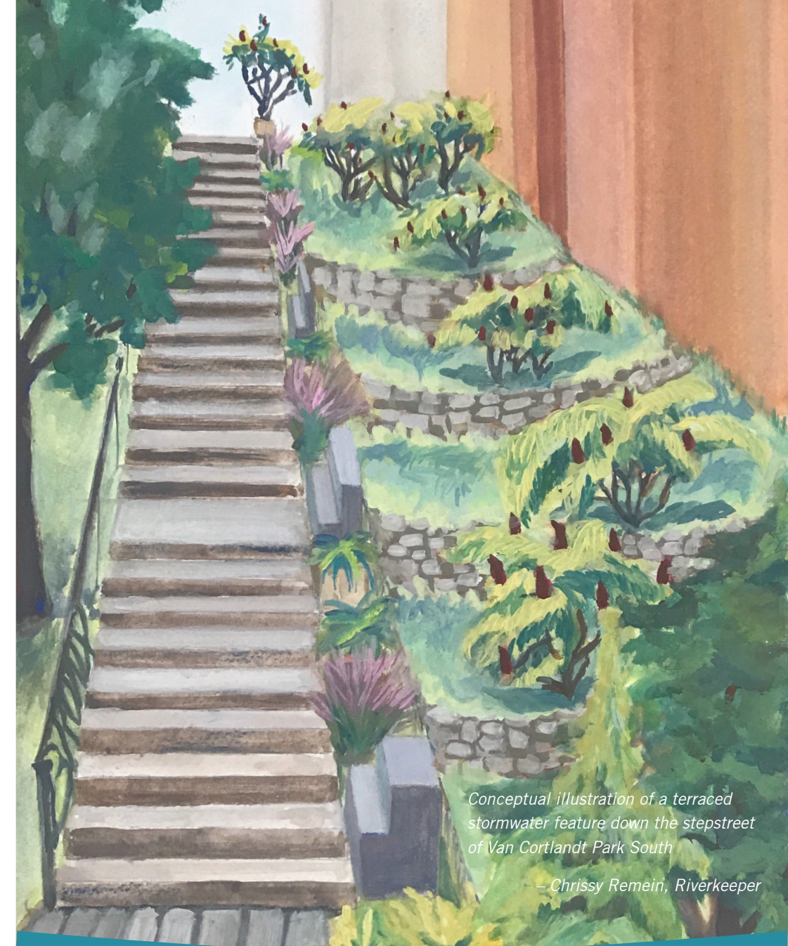
Conceptual illustration of a terraced stormwater feature down the stepstreet of Van Cortlandt Park South